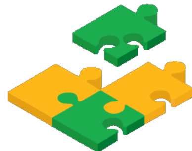
Figure 4: Supply chain strategy could contribute to the overall competitive goal. Developed by LINCS Consortium.

Supply chains are designed to fit strategically with defined corporate strategies; the numerous organizations and activities in supply chains work together to contribute to the overall goals and objectives associated with those strategies. Understanding