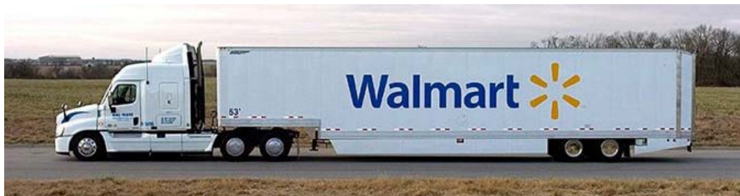
Figure 3: By Walmart from Bentonville, USA (Walmart's Grease Fuel Truck) CC BY 2.0 http://www.creativecommons.org/licenses/by/2.0 ), via Wikimedia Commons.

In fact, the supply chains of two different retail stores, even selling the same items, can be quite different. Walmart owns their distribution centers and has their own fleet of trucks to serve their immense number of retail stores and control the flow and availability of products.