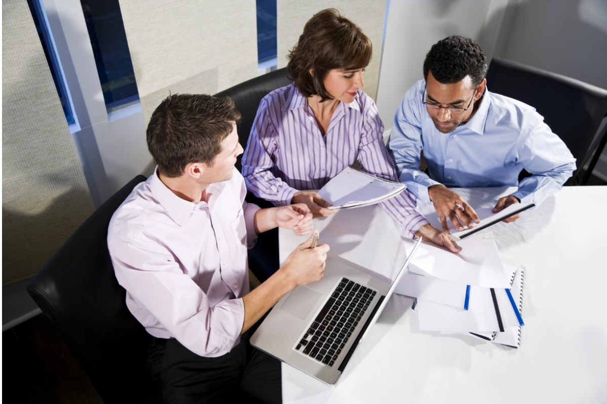
Figure 5. Professionals managing the flow of goods, services, funds, and information between suppliers and customers.